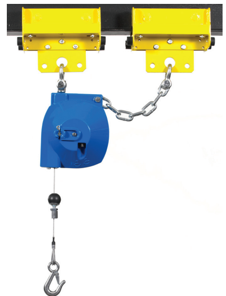
EB Model, Rear View, Trolley Application