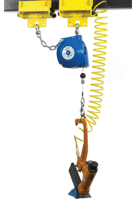
EB Model, Trolley Nail-Gun Application