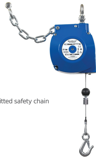
EB Model Balancer, Front View

Dimensions and Weight for Reference Only [±5%]. Subject to change without notice.